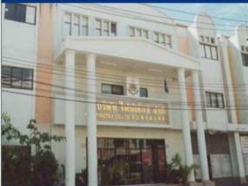
Phetkasem Rd., Sampran, Nakorn Patom