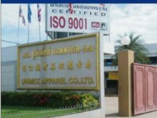
Banrai, Ladyao, Nakorn Sawan