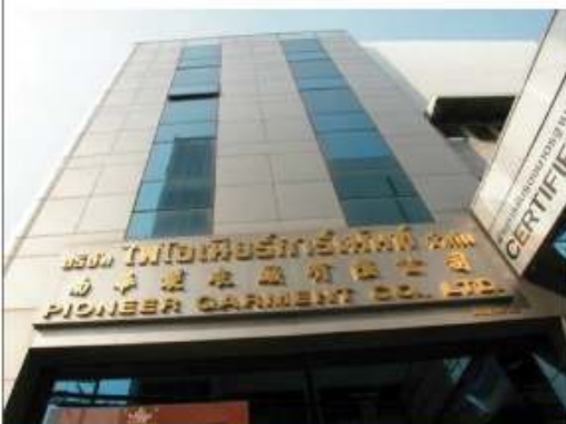
Phetkasem Rd., Pasijareon, Bangkok